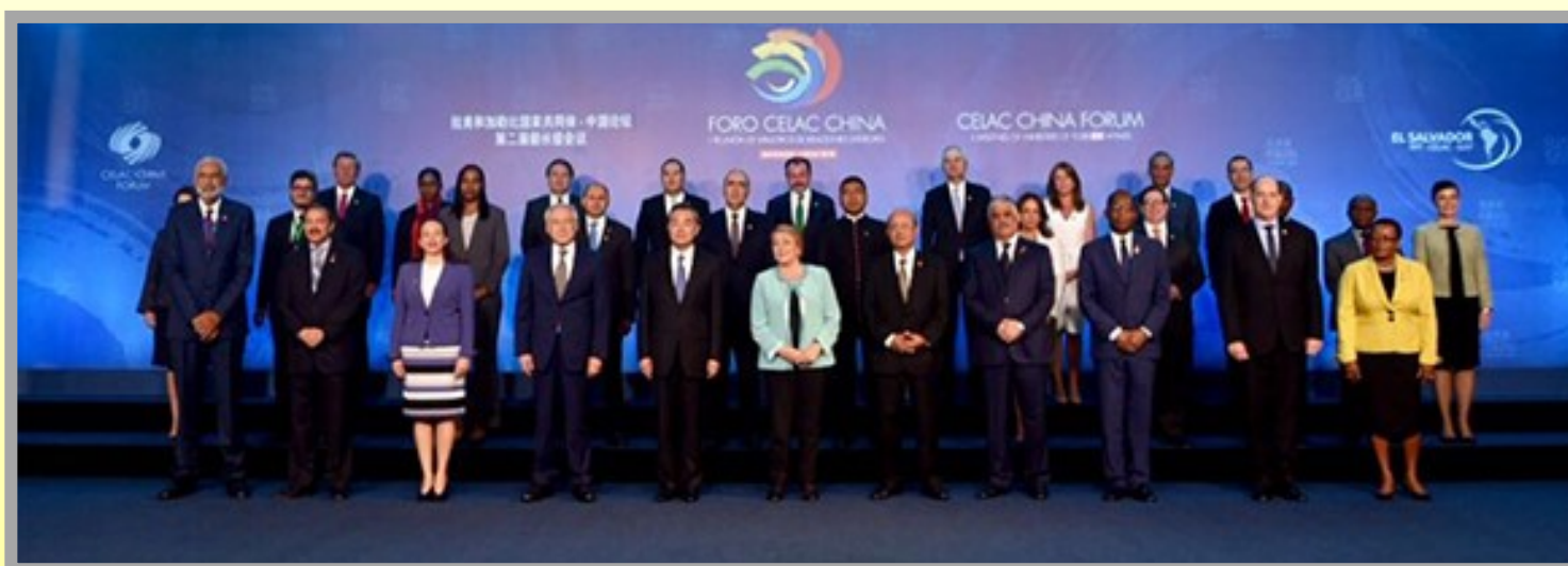
Group Photograph of the delegates of the Second Meeting of Ministers of Foreign Affairs of the CELAC-China Forum.