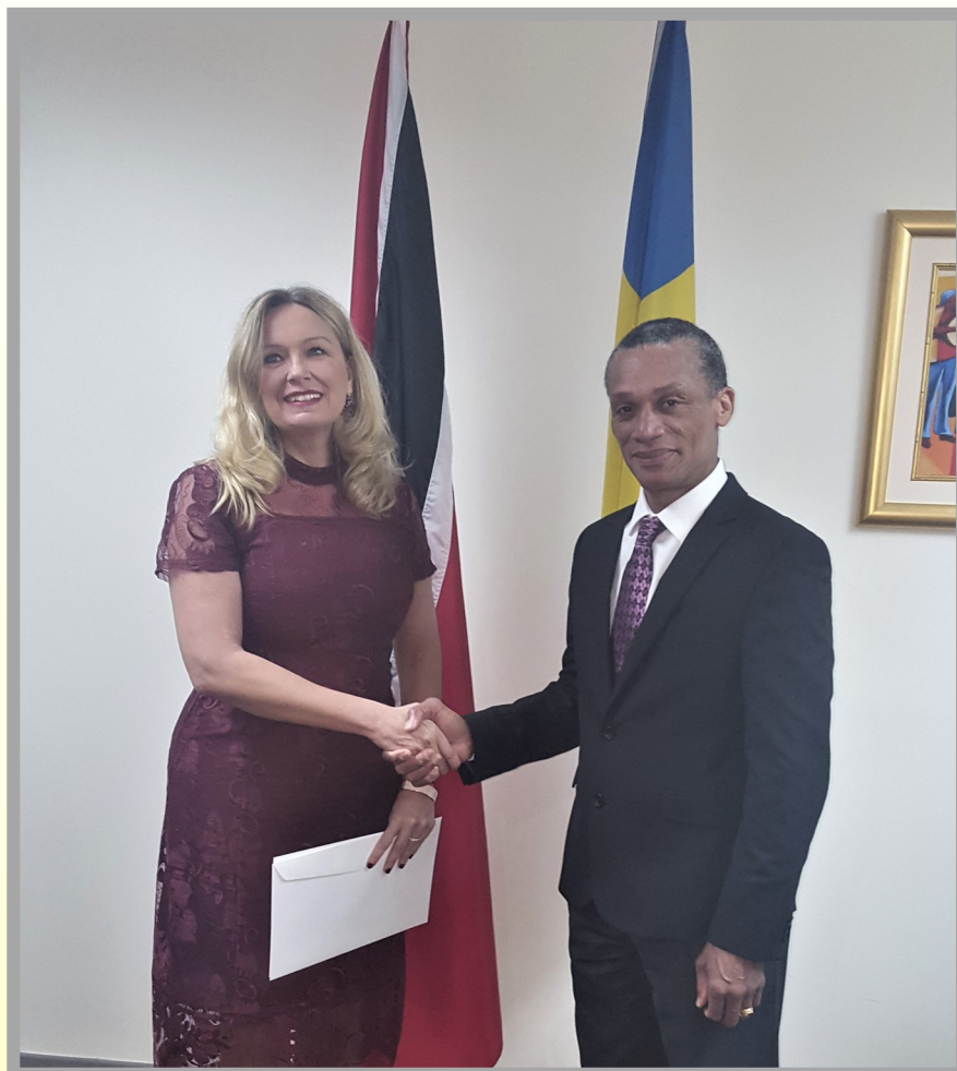
Senator the Honourable Dennis Moses, Minister of Foreign and CARICOM Affairs greets Her Excellency Elisabeth Eklund, newly appointed Ambassador of the Kingdom of Sweden during a Courtesy Call at the Ministry's headquarters on 6th February, 2018.

On 6th February, 2018, Senator the Honourable Dennis Moses, Minister of Foreign and CARICOM Affairs welcomed Her Excellency Elisabeth Eklund, newly appointed Ambassador of the Kingdom of Sweden resident in Stockholm, Sweden, during a Courtesy Call at the Ministry's headquarters. The Courtesy Call on Minister Moses preceded Ambassador Eklund's presentation of her Letters of Credence to the President of the Republic of Trinidad and Tobago.