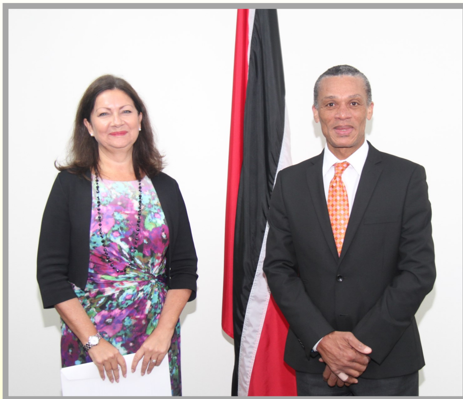
Senator the Honourable Dennis Moses, Minister of Foreign and CARICOM Affairs with Her Excellency Ingrid Mollestad, newly appointed Ambassador of the Kingdom of Norway during a Courtesy Call at the Ministry's headquarters on 7th February, 2018.

On 7th February, 2018, Her Excellency Ingrid Mollestad, newly appointed Ambassador of the Kingdom of Norway resident in Havana, Cuba, paid a Courtesy Call on Senator the Honourable Dennis Moses, Minister of Foreign and CARICOM Affairs at the Ministry's headquarters. The Courtesy Call on Minister Moses preceded Ambassador Mollestad's presentation of her Letters of Credence to the President of the Republic of Trinidad and Tobago.