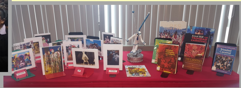
Carnival literature on display compliments of the Library Unit.