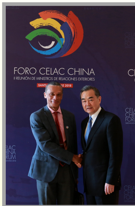
Senator the Honourable Dennis Moses, Minister of Foreign and CARICOM Affairs of the Republic of Trinidad and Tobago and His Excellency Wang Yi, Minister of Foreign Affairs of the People's Republic of China greet before the Meeting held between the Minister of Foreign Affairs of the People's Republic of China and Ministers of Foreign Affairs of Caribbean States at the CELAC-China Forum on 21st January, 2018.

Senator the Honourable Dennis Moses, Minister of Foreign and CARICOM Affairs called on the People's Republic of China and the Member States of CELAC "to look closely at where we need to join forces and cooperate on the basis of a shared destiny, shared interests and shared rewards." He further emphasized that "from climate change to human rights, from peace and security to food security, we are so much stronger when we support each other and face these complex challenges as joint tenants of planet earth."