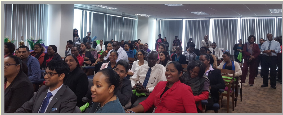
Cross section of the crowd enjoying the performances.