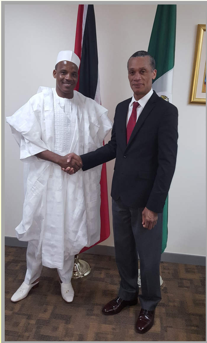
Senator the Honourable Dennis Moses, Minister of Foreign and CARICOM Affairs greets His Excellency Jika Ardo Hassan, High Commissioner for the Federal Republic of Nigeria during a Courtesy Call at the Ministry's headquarters on 30th January, 2018.

On 30th January, 2018 Senator the Honourable Dennis Moses, Minister of Foreign and CARICOM Affairs and His Excellency Jika Ardo Hassan, newly appointed High Commissioner for the Federal Republic of Nigeria to the Republic of Trinidad and Tobago, reaffirmed the commitment of both countries to strengthen bilateral relations.